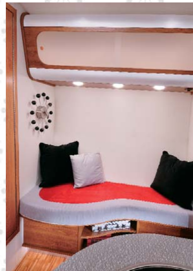
Shasta's comfy lounge/storage bay features overhead reading lamps and a retro wall clock.