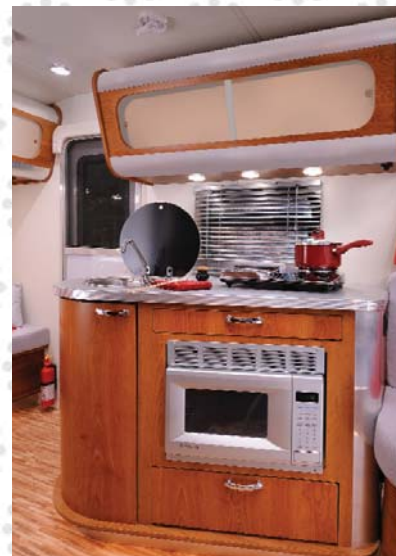
The kitchenette features a stylish hot plate, stainless steel sink and microwave and chrome-edged laminate countertop.