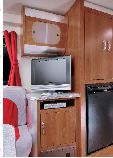
Shasta Airflyte™ is equipped with a 19" LCD Television and a DVD player.